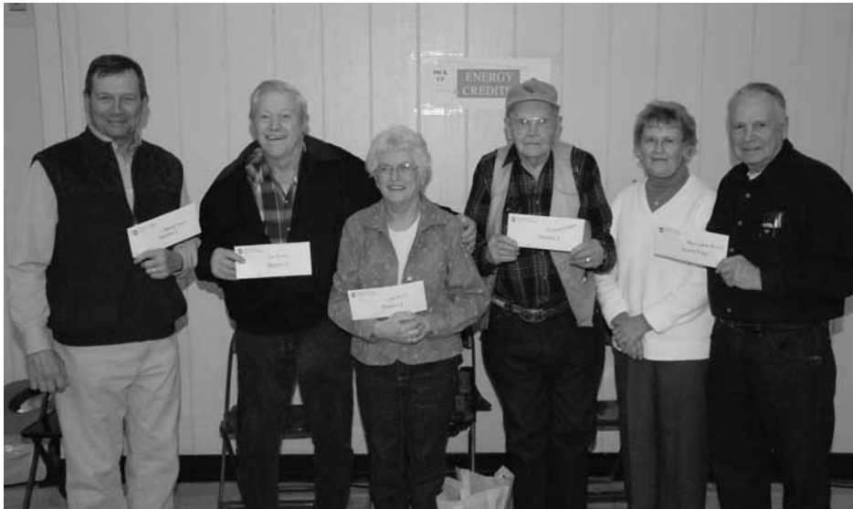
The winners of the 2010 District prizes and Grand Prize. This year, we will again award one $50 bill credit to someone from each of the five Districts, as well as one $250 bill credit Grand Prize!

approved a refund of capital credits to the membership. Refund checks will be handed out to members that attend the 72nd Annual Meeting in Greybull. Those members that are unable to attend will receive their refund checks by mail after the meeting. Checks will be issued to those members who received power from Big Horn during any of the years of 1976 through 1979.