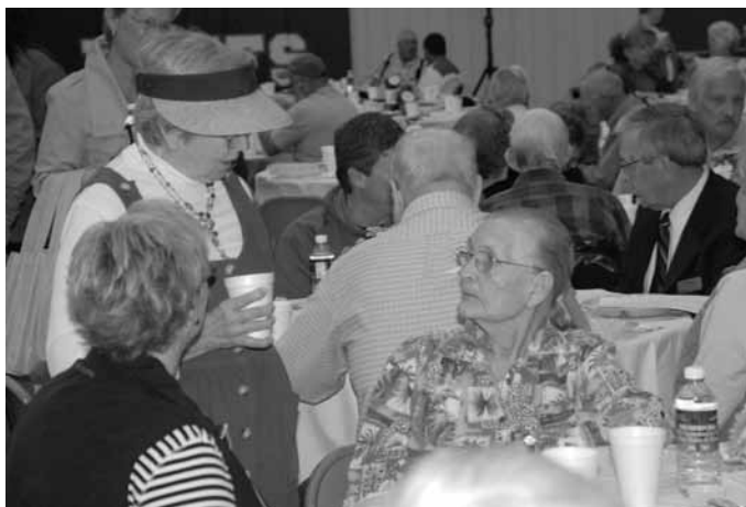
Not only can you learn about your electric company, but Annual Meeting is a great time to catch up with your friends and neighbors.

for Directorate District #4 which includes the Meeteetse area. Look for their candidate profiles in next month's issue of Highlights. You are encouraged to carefully read the candidate statements so that you