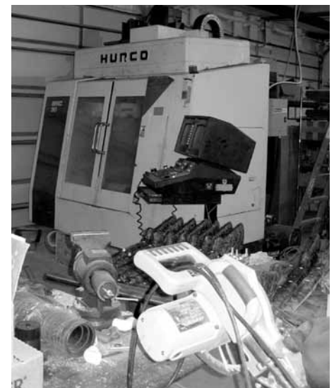
One of two CNC (computer numeric control) machines in the Burlington manufacturing shop. This machine produces the custom stock for each rifle.

For more information on Gunwerks, please check out their websites. Their gun selection can be found on www.gunwerks.com , for the rifle scope, go to www.huske-maw.com and for other long-range products, be sure to head to www.longrangestore.com .