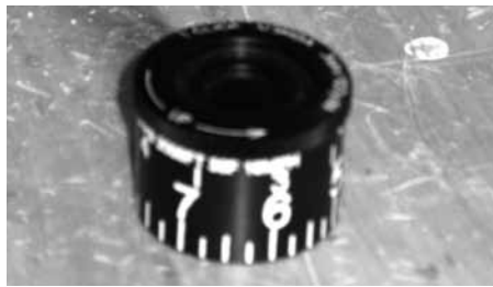
The turret – the magic behind each long-range rifle built by Gunwerks.